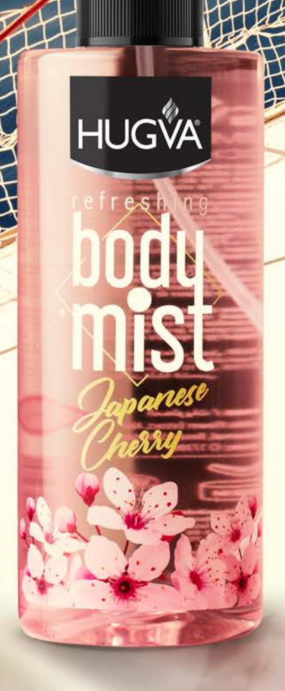
Japanese Cherry 250 ml MM11.0203