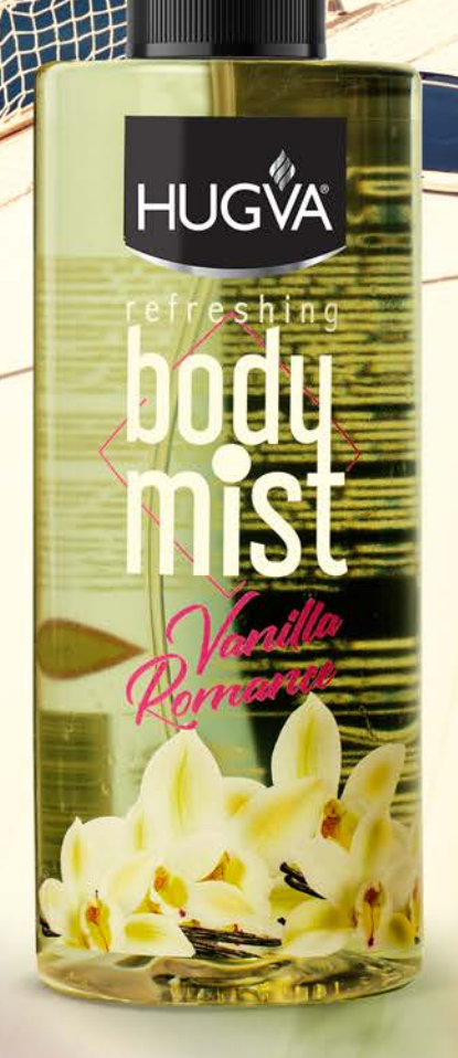
Vanilla Romance 250 ml MM11.0204